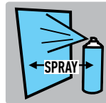
← SPRAY →