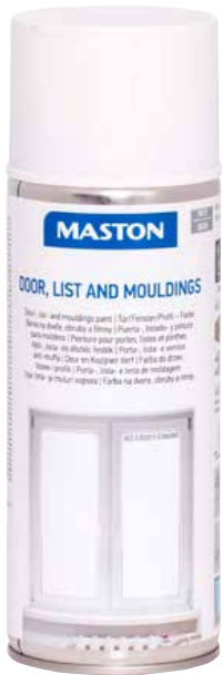
NCS S 0502-Y